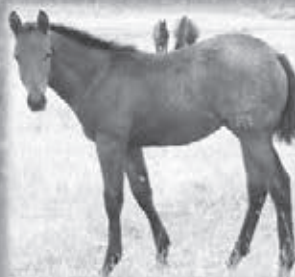
Foals by MRI Snips Spirit