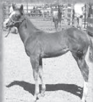
Foals by EZ Nick Bar